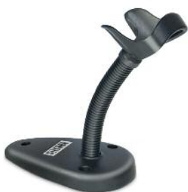
STD-QD20-BK: Hands-free Stand Allows use of the reader in hands-free mode. Also available in white.