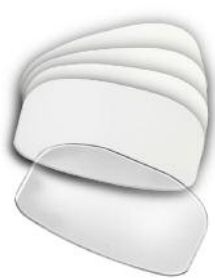
11-0318: Replacement Window 5 pack Allows the user to replace a damaged window without sending the scanner in for repairs.